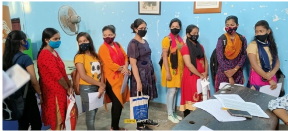
Queue for the name registration for vaccination