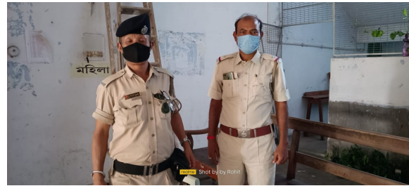
Police personnel at their duties